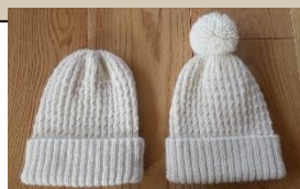
Ivory 100% YT alpaca beanies in Twist style

Choose Alpaca Christmas Cards to go with your alpaca pressie