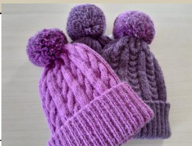
Beanies and lilac pink and plum with two colour poms in our wheat and cable styles