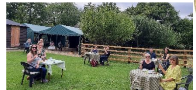
First Sparkling cream tea of the

Things looked up for the remaining births as our first grey was born (Zebedee) soon after Yogi. By the end of August we had a total of seven cria of which five were boys. The more boys the better for us as we need to breed boys for our walking team.