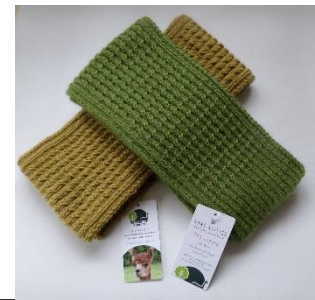
Twist scarves in Mustard and Moss green

A reminder you can buy alpaca beanies, scarves, gloves and wristwarmers at Yew Tree online or at our Christmas shop 7 th -12 th Dec. Expertly hand knitted in Buntingford by our select team of knitters in three styles, you can match both colour and style. Either in 100% alpaca from our own herd or knitted in a lovely range of coloured alpaca yarns, they are all extremely soft and warm and make lovely presents or buy for yourself as a Winter warmer.